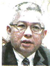
Dr Adham Baba

Beliau berkata demikian ketika mengulas saranan pakar virologi supaya kerajaan mengubah strategi pemberian vaksin COVID-19 dengan mempercepatkan vaksinasi di negeri atau lokaliti berisiko tinggi dengan kepadatan penduduk lebih tinggi seperti Kuala Lumpur dan Selangor.