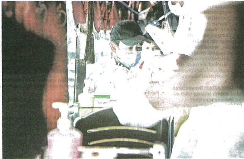
SEORANG lelaki menerima suntikan vaksin di dalam sebuah bas yang digunakan sebagai pusat vaksin bergerak sempena kempen Vaksinasi Covid-19@Wilayah Prihatin di Flat Sri Johor, Cheras, semalam.

Ketua Pengarah Kesihatan, Tan Sri Dr. Noor Hisham Abdullah berkata, daripada jumlah kes harian semalam, Selangor merekodkan sebanyak 1,582 kes, diikuti oleh Negeri Sembilan sebanyak