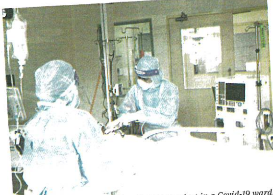
Sungai Buloh Hospital staff tending to a patient in a Covid-19 ward.

"We can beat this, because Malaysians are always committed to a life-saving cause and they persevere."