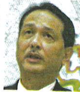
Dr Noor Hisham Abdullah

"Sejumlah 139 individu telah disaring di mana 45 kes dikesan positif COVID-19 termasuk kes indeks, 23 kes didapati negatif dan 71 kes masih menunggu keputusan makmal," kata kenyataan itu.